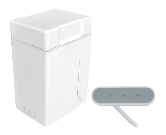
DR202 Battery Support