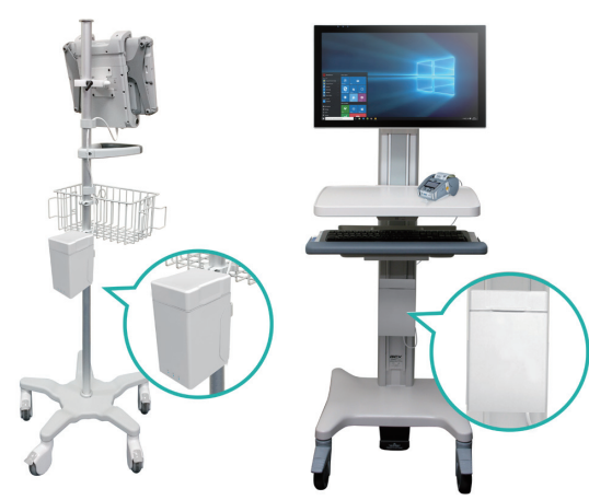
19V DC-output charges DT Research medical tablet