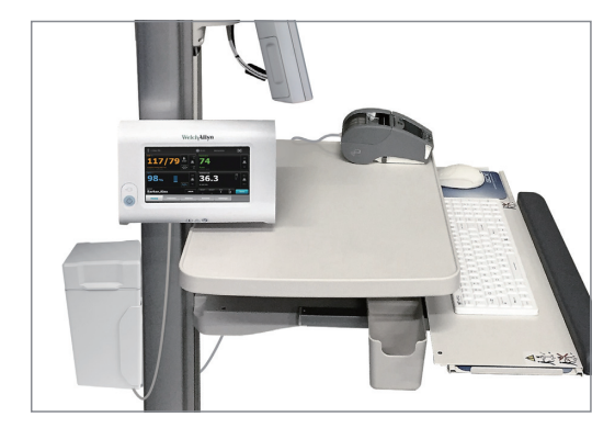
15V DC-output powers vital sign monitor